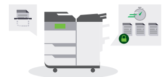
Translate hardcopy documents in seconds